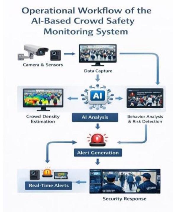
Fig. 1. Operational workflow of the AI-based crowd safety monitoring system.

The methodology of the proposed AI-based crowd safety monitoring system is designed to perform real-time data acquisition, intelligent processing, and automated decision-making. The system follows a structured pipeline that transforms raw surveillance data into actionable safety alerts. The workflow is shown in Fig. 1.